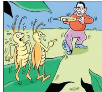
"There's a gleam in his eye!"

Activity 3: Nowadays, pesticides and various other sprays are being used to get rid of bed bugs. But was it always like that? Interview your grandfather, grandmother, parents etc and find out what they did to deal with the problem? How much trouble did it cause them? Did the bed bug cause any diseases? Did it cause any allergy?