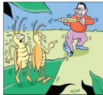
"There's a gleam in his eye!"

Activity 3: Nowadays, pesticides and various other sprays are being used to get rid of bed bugs. But was it always like that? Interview your grandfather, grandmother, parents etc and find out what they did to deal with the problem? How much trouble did it cause them? Did the bed bug cause any diseases? Did it cause any allergy?