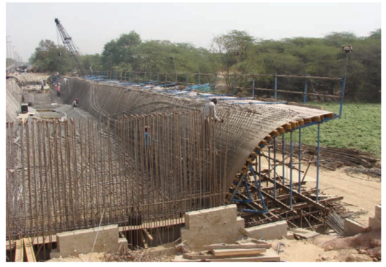
Photograph 11 : Neela Hauz, New Delhi, encroached by a bridge. Growth of water hyacinth is observed all over the lake. May, 2010

In April 1995, Subhash Dutta on behalf of the Howarh Gantantrik Nagarik Samiti (HGNS), a Kolkata-based non-governmental organisation, filed PIL in the SC against the Government of West Bengal and the civic authorities of Howrah, a satellite township near Kolkata. In his 486-pages petition, along with other civic issues, Dutta pleaded for judicial intervention for protection of 110 urban water tanks located in Howrah, SC referred the matter back to the Calcutta High Court (HC) on