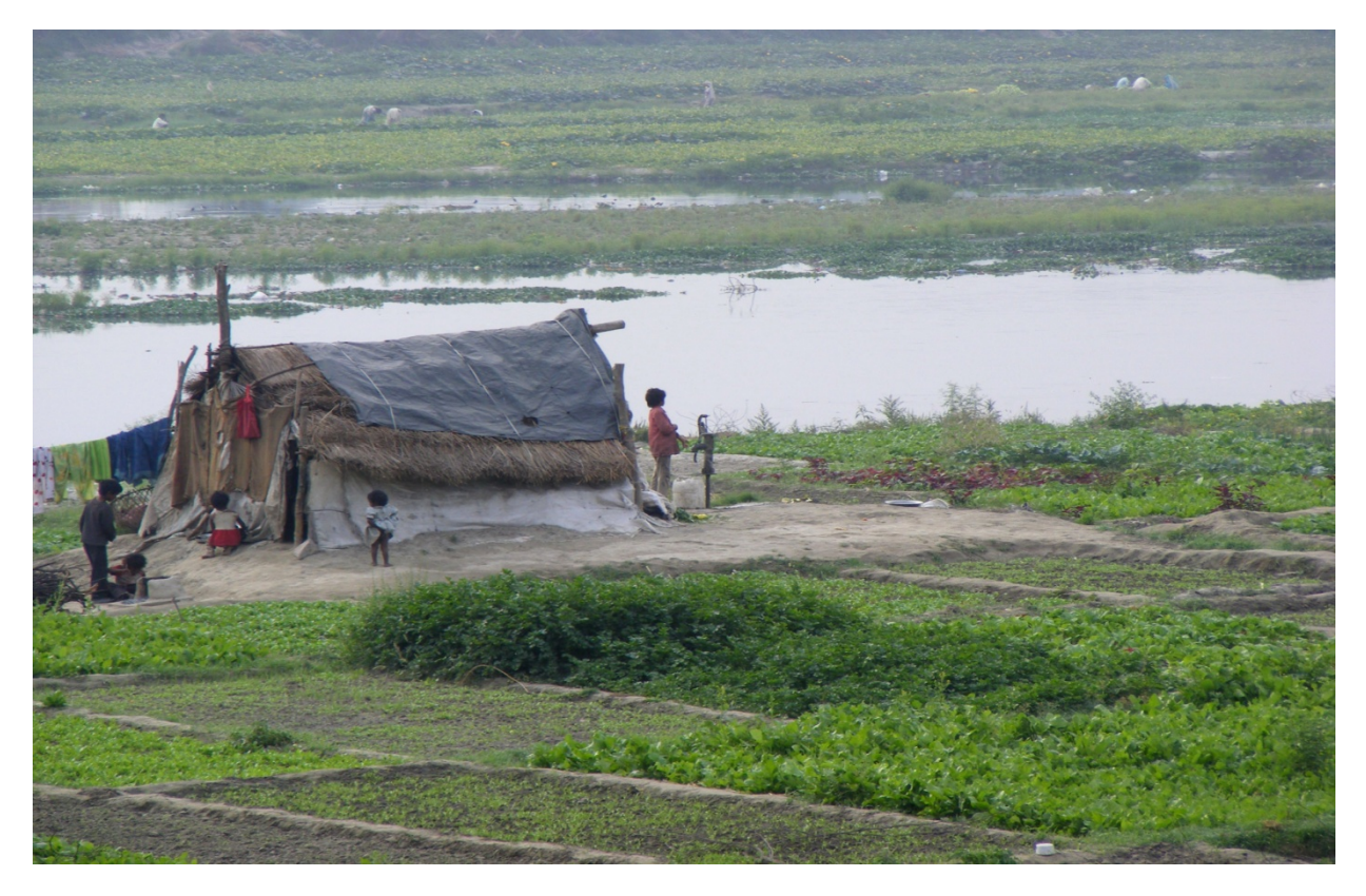
An estimated 20,000 million litres of sewage is currently used for irrigation every day—more than half of it untreated

treatment plants can easily deal with this range. But for most Indian towns and cities, inlet parameters far exceed stipulated limits, due to untreated sewage outfalls upstream. The Ministry of Environment and Forests having set limits for several pollution parameters is yet to decide on coliform, a key indicator of pathogenic contamination. The criteria are being developed to be monitored at the outlet of sewage treatment plants. The current norm for total coliform counts under consideration is 10,000MPN/100ml.