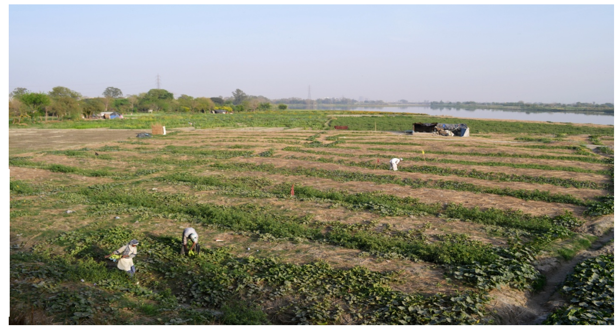
Use of partially treated water for farming in river floodplains is a common practice in India

In India, given that gross pollution exists due to untreated sewage outfalls, the CPCB has highlighted high coliform levels in lakes and rivers as an area of concern despite expenditure via the various river and lake conservation plans of the Centre. Given that sewage generation outstrips sewage treatment, and use of partially treated sewage for agriculture remainsunregulated, the environment ministry constituted a committee in 1999 which recommended desirable limit of faecal coliform at 1,000 MPN/100mland a maximum permissible limit at 10,000 MPN/100ml for discharge of treated sewage into a water body or reuse for agriculture, aquaculture or forestry applications. While the WHO standard was set based on point of use, the Indian standard is being developed at the outlet of the sewage treatment plant. The Ministry of Urban Development too formed a committee in 2004 that recommended desirable limit of faecal coliform at 500 MPN/100ml and maximum permissible limit at 2,500 MPN/100ml for discharge into the Yamuna stretch in Delhi. The standards were not practicable, given that existing treatment plants were not capable of reducing the coliform count to these levels. The Central Pollution Control Board initiated a study looking at the prevailing sewage treatment technologies and their ability to reduce coliform levels from the inlet to the outlet. Published in 2008, the study sought to evolve techno-economically feasible microbiological standards for disposal of treated sewage.