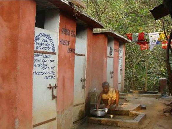
Toilets and Bathing Rooms

One of the major areas of Gram Vikas' activities is natural resource management. Under this programme, it has launched the rural health and environment programme (RHEP) in 1992. One of the main